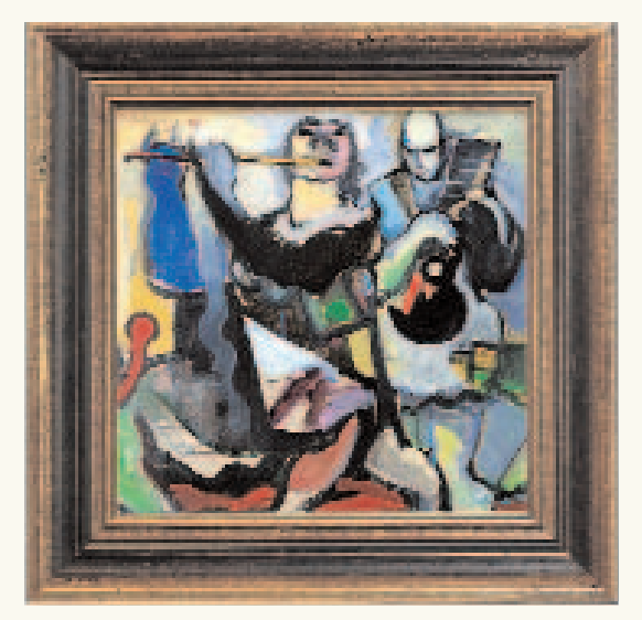
Specializing in Custom Frames by LARSON: JUHL